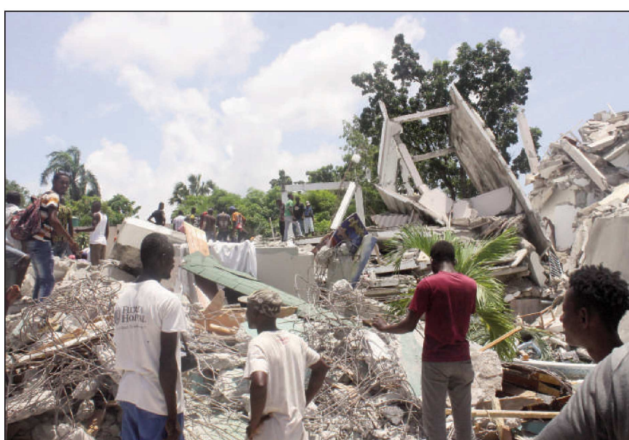
People search through the rubble of what used to be the Manguier Hotel after the earthquake hit on Saturday in Les Cayes, southwest Haiti

avirus pandemic, a presidential assassination and deepening poverty. The epicentre of the quake was about 125 km (78 miles) west of the capital of Port-au-Prince, the US Geological Survey said. The widespread damage could worsen by early next week, with Tropical Storm Grace predicted to reach Haiti late Monday or early Tuesday. Aftershocks were felt throughout the day and late into the night, when many people now homeless or frightened by the possibility of their fractured homes collapsing on them stayed in the streets to sleep - if their nerves allowed them. In the badly damaged coastal town of Les Cayes, under darkness that was only punctured by flashlights, some praised God for surviving the earthquake.