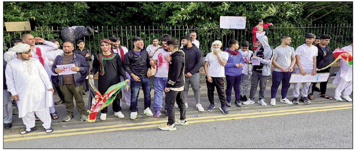
Afghan diaspora in UK hold placards during a protest against Taliban offensive