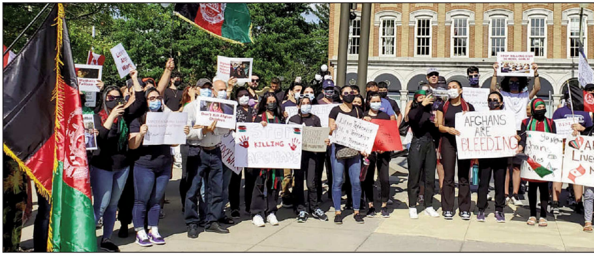
Afghan diaspora in Australia protest Pak support for terrorism in Afghanistan, in Sydney